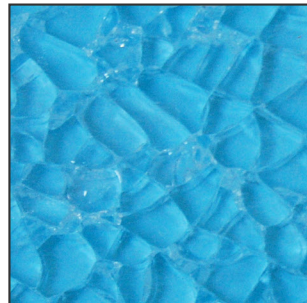
Toughened glass always shatters into hundreds of tiny pieces when broken